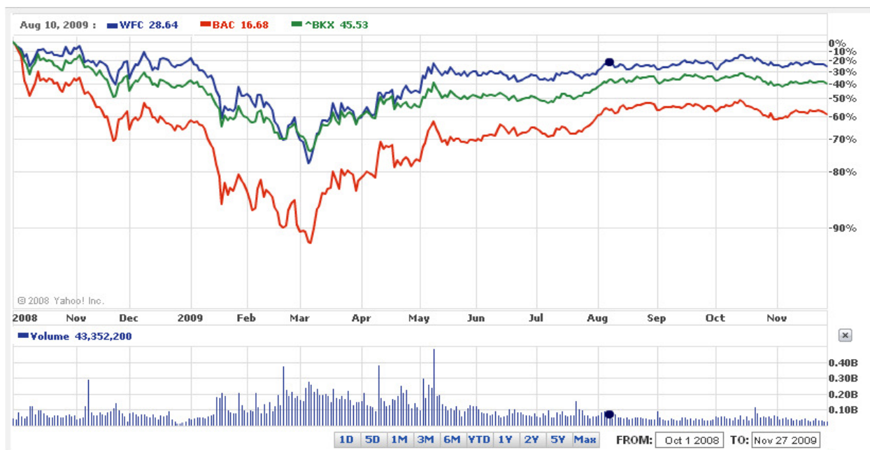
Figure 2. Post-Acquisition Stock Performance

BAC after buying MER posted a loss of about $2.4 billion in for the quarter ending December 2008. BAC also lost about $1 billion for the third quarter of 2009. For the period, BAC reported that its personnel costs and operating costs increased to $16.3 billion from $11.7 billion previous year, mainly due to MER acquisition 21 . MER continues to be a loss making center for BAC as mentioned BAC in its 10Q of Q3 09 -“net loss increased as higher gains on the sale of debt securities and higher equity investment income were more than offset by the negative credit valuation adjustment on certain Merrill Lynch structured notes.” This could also be seen reflect in Figure 1 showing that BAC’s Value added Risk increased after the acquisition of MER and is yet to return to its pre-acquisition levels. For the quarter ending December 2008, WFC posted a loss of $2.55 Billion after the acquisition of WB. Even though the losses reported by the two companies, BAC and WFC, after their respective acquisitions were comparable, their share performance have been markedly different.